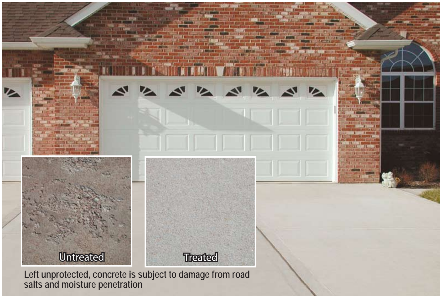
Left unprotected, concrete is subject to damage from road salts and moisture penetration